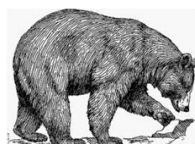
Bear R : 3230