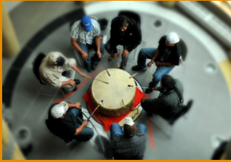
Drummers, First Peoples Pavillion

Multipurpose Room, First Peoples Pavilion