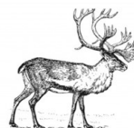
Caribou R : 4121