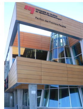
First Peoples Pavilion