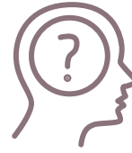
Human and Social Development