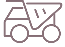
Mines and Groundwater