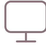
Creation and New Media